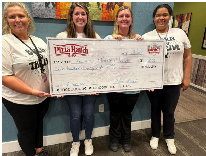
Community shows up in BIG ways Thank you to everyone who supported our Pizza Ranch fundraiser—every slice shared helps build recovery in our community.