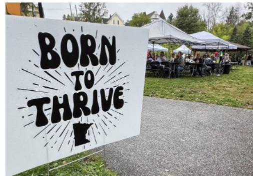
Born to Thrive: The Message that guided our 2025 Recovery Month!