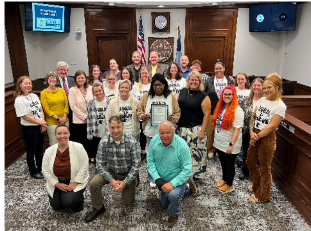
RAD Staff and St. Louis County Commissioners

RAD hosted t-shirt pop ups all over St. Louis County. Thank you to our hosts at Partners, Life House, 2540 Coffee House, WebMed and the Damiano Center.