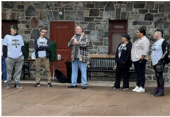
Community members and team sharing what thriving means to them at the 2025 Walk for Recovery.