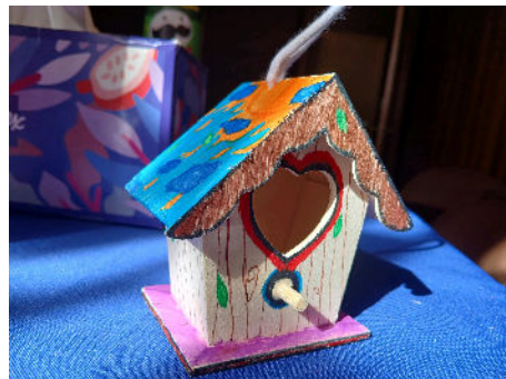
A bird house someone decorated at one of our All Recovery Meetings.

In 2025 we hosted over 60 Events. Our events ranged from Kickball, hikes, Cupcakes to Movie Nights!