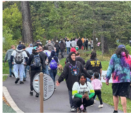
Walk for Recovery 2025— rain didn't stop us!