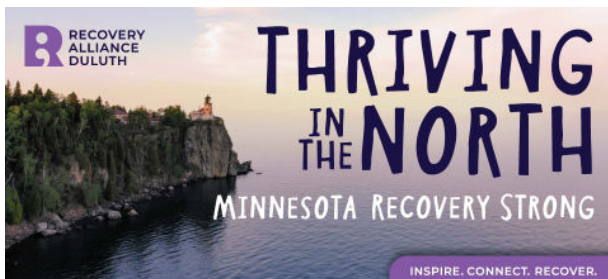
Recovery Month billboard sharing a clear message: Thriving in the North. Minnesota Recovery Strong.

To build and mobilize a compassionate community to support individuals seeking or maintaining recovery to inspire hope, create connection and eliminate stigma.