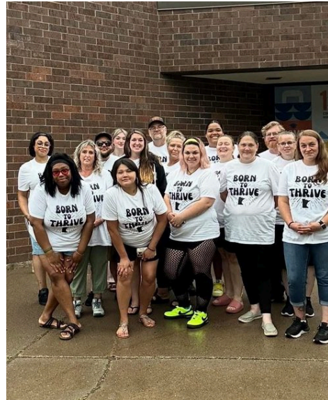
Our first Northland Peer Recovery Academy cohort. A group of community leaders stepping into their purpose and showing what's possible in recovery.