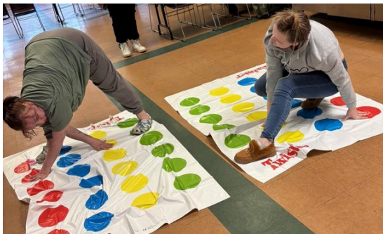
A fun game of Twister at our 90's event with Health Realization!