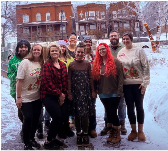
Our RAD team getting into the Grinchmas spirit!