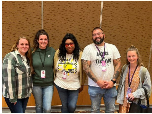
Some of our team after presenting at the 2025 St. Louis County Health and Human Service Conference.