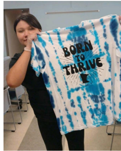
Our Annual Recovery Month tie-dye tees!