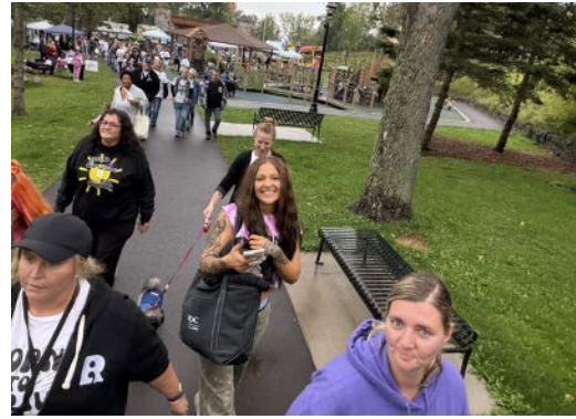
The beginning of the walk! 2025 Walk for Recovery