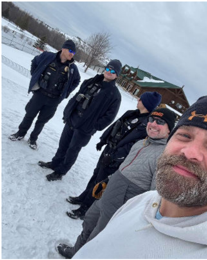
Annual sledding day with the Virginia Police Department We look forward to this every year!